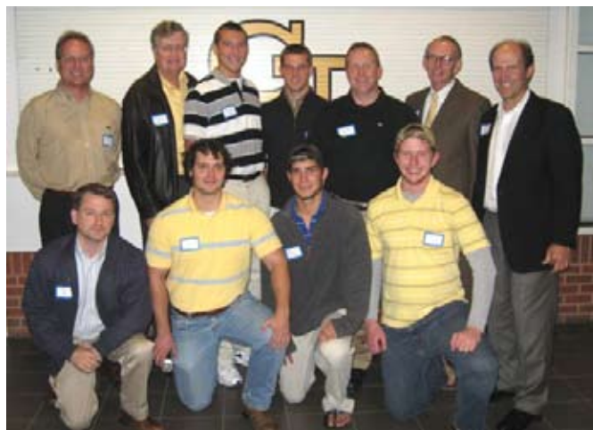
Alumni and undergraduates gather on campus during Homecoming.

We each have stories of what TKE has meant to us and how it has affected our lives. And we all share a debt to those who came before us and created the fraternity that we inherited. Whether we go back to 1948, to those vets who