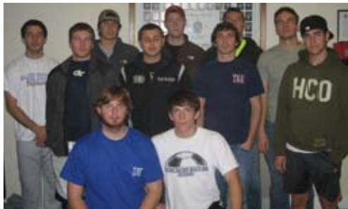
Spring 2009 Chapter Officers