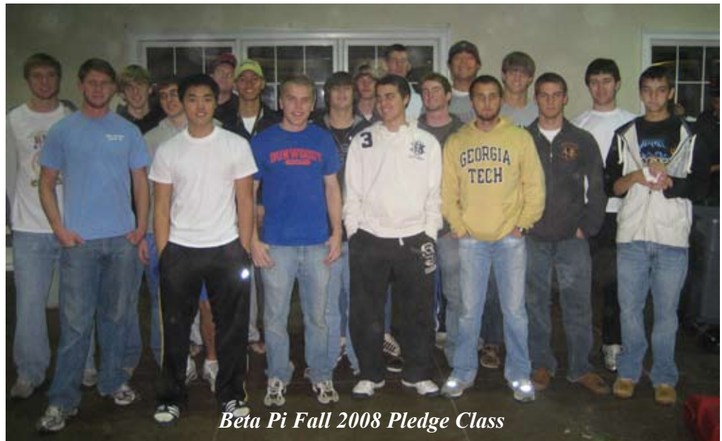
Beta Pi Fall 2008 Pledge Class