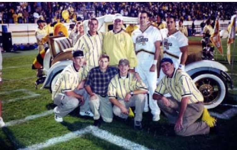
Beta Pi members from the 2000's gather around the Wrablin' Wreck during Homecoming football game.